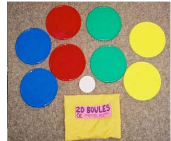
2 Dimensional Boules