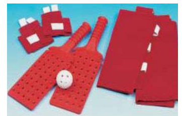
Mini Polybat Set