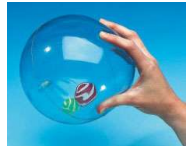
Spordas Sensation Ball

Soft versions of Frisbee are available in the catalogues but it is also worth checking out pet shops for dog Frisbees, which are often soft, interesting textures, and don't fly too far!