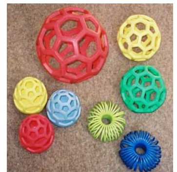
(clockwise from left) Dino Eggs, Large and Small Rubber Flex GrabBalls, Rubber Hacky Sacks